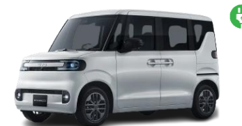
比亚迪 Racco CEPS