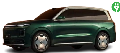
零跑 D19 半轴