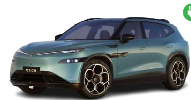
大众 与众08 REPS, 管柱