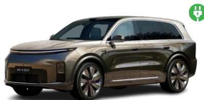
理想 L9 Livis 线控转向