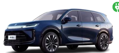
上汽通用五菱 宝骏 华境S REPS