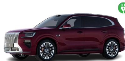
极氪 8X REPS