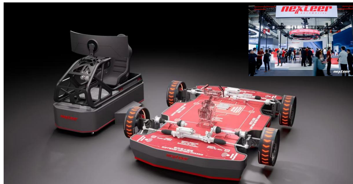
以“M 3 ”为主题登陆2026北京车展

(1) SbW: 线控转向; (2) RWS: 后轮转向; (3) EMB: 电子机械制动